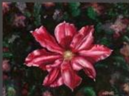
Clematis Dream , age 8