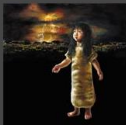
Faith, age 9