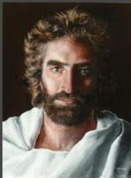
The Prince of Peace, age 8