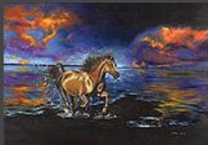
Freedom Horse , age 9