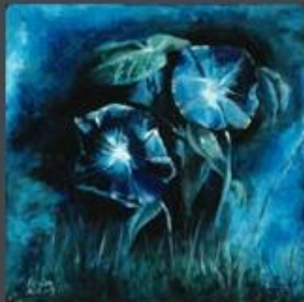
Dance of the Mind , age 9