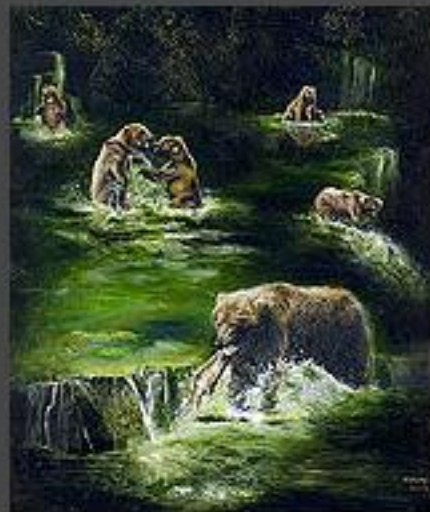
The Bears , age 9