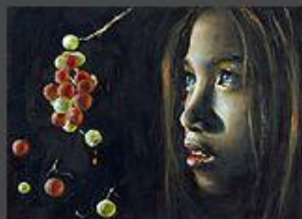
Forbidden Fruit, age 10