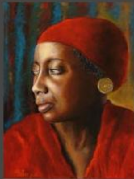
The Planted Eyes, age 8