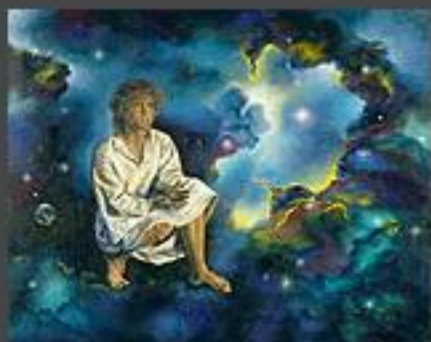
Jesus the Missing Years , age 10