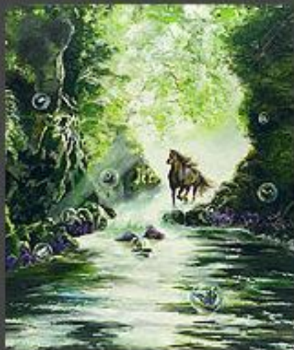
The Butterfly Passion, age 10