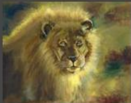
Strength , age 7