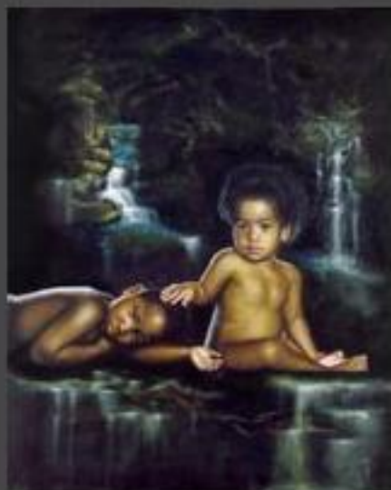
Found , age 9