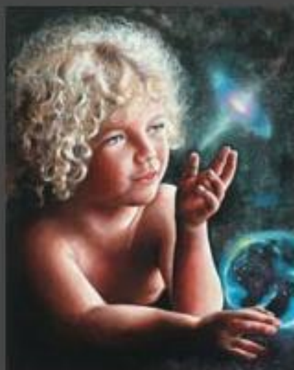
The Journey, age 9